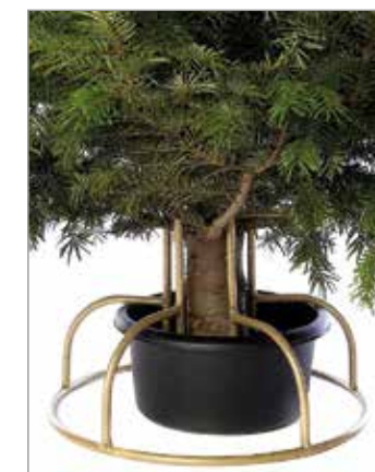
Top with water to keep tree fresh