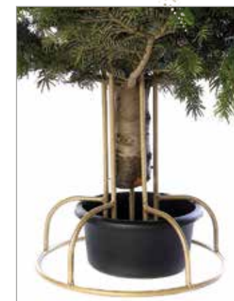
Slide tree down into water chamber