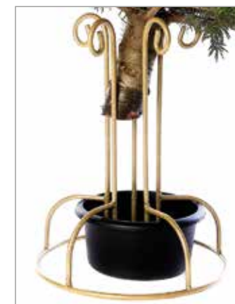
Position tree between metal rods